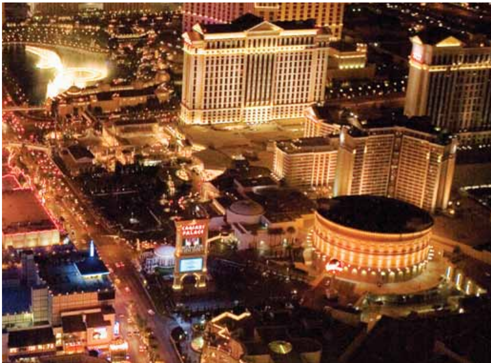
Caesars Palace lit up at night on the Vegas Strip May 18 – 21, 2014 – Caesars Palace Las Vegas