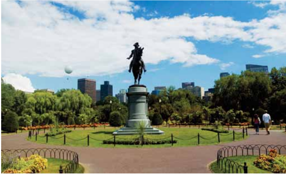
Boston Public Gardens, Boston, MA May 19 – 22, 2013 – Sheraton Boston